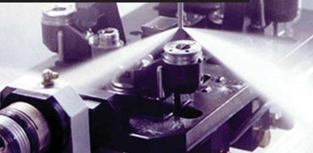
Robot manipulating parts into hydro-jet